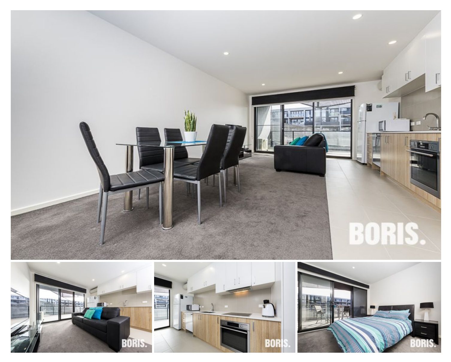
17/30 Lonsdale Street Braddon ACT

The location needs no introduction - you are right in the mix of Canberra's most cosmopolitan precinct. This terrific, over-sized one bedroom apartment, is tastefully furnished and fully equipped. Situated on the third floor this apartment is sunny and light-filled and in fantastic, as new condition.