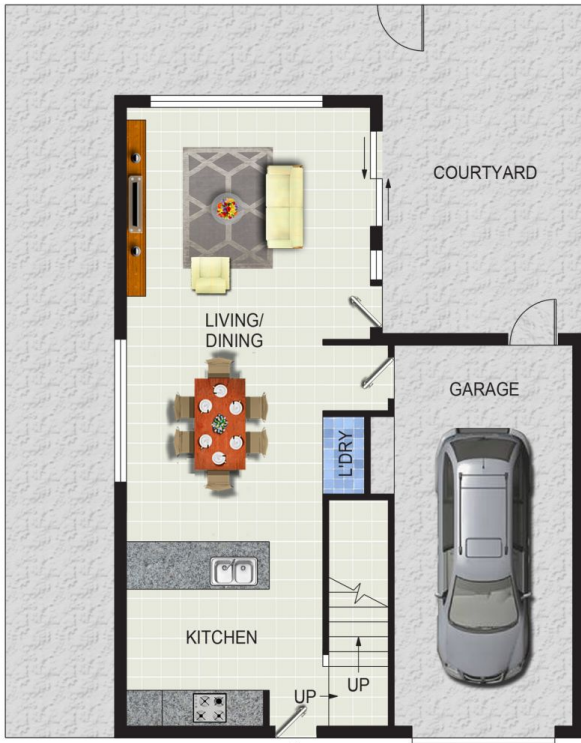
ENTRY GROUND LEVEL FLOOR PLAN